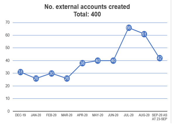
Figure 1: Number of user accounts created

The increasing trend to lodge renewal applications in TMS continues. As of 23 September 2020, the number of renewal applications lodged via TMS continues to exceed the number lodged offline (see Figure 2).