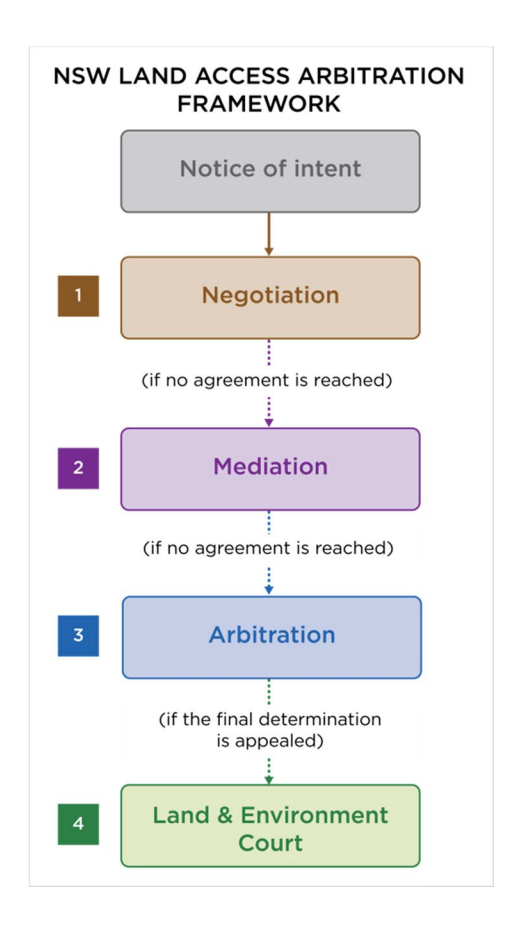
Figure 1. Overview of the land access framework

7.4 A summary of the key legislative provisions is provided in Annexure 1.